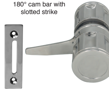
Fig. 0740 002 CHR 180° cam bar with slotted strike