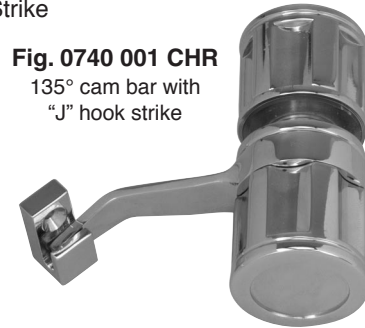
Fig. 0740 001 CHR 135° cam bar with “J” hook strike